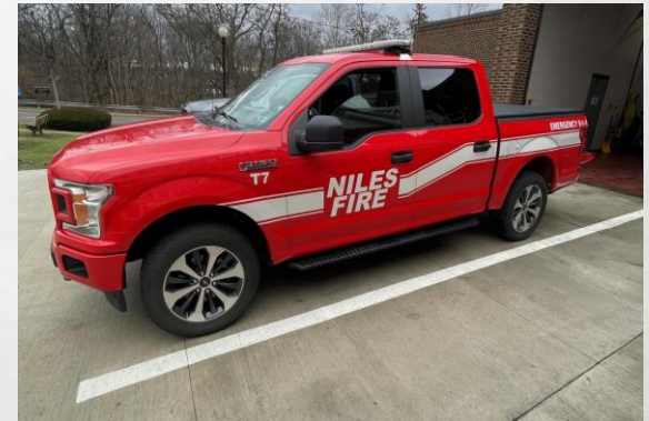
Pickup truck 7

2020 Ford F150 Acquired with CARES ACT funds $32,500