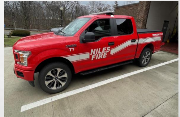
Pickup truck 7

2020 Ford F150 Acquired with CARES ACT funds $32,500