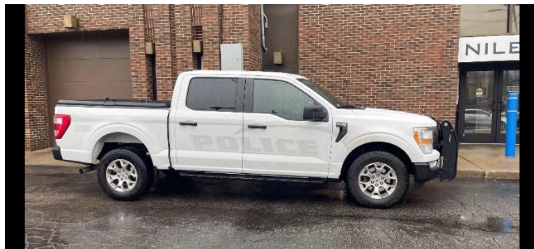
2022 Ford F150 Police Responder