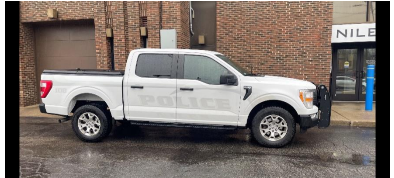
2022 Ford F150 Police Responder