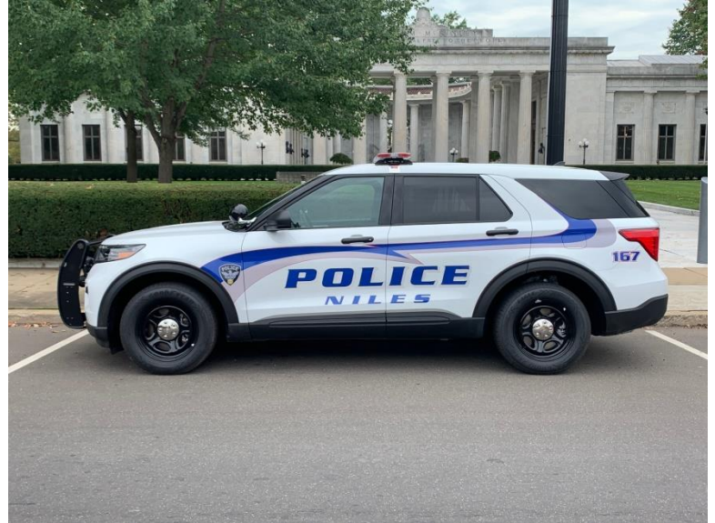
2020 Ford Explorer Police Interceptor